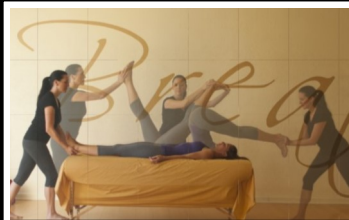
Table Tai Yoga Massage Training

Sat. February 9th & Sun. February 10th 12pm - 8pm